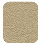
out in the field