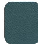
ski teal we drop