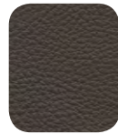
cocoa a go go