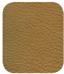
dust of winter