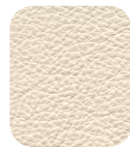
pink with passion