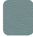
the spa feel