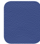
burst of blue