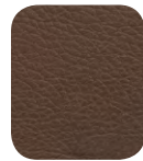
little brown dress