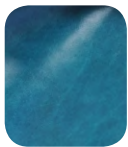
birds of a feather