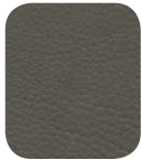
steeling the scene