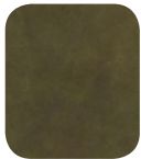
old fave green