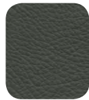
into the night