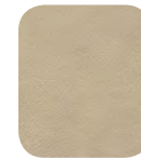
pedal to the medal